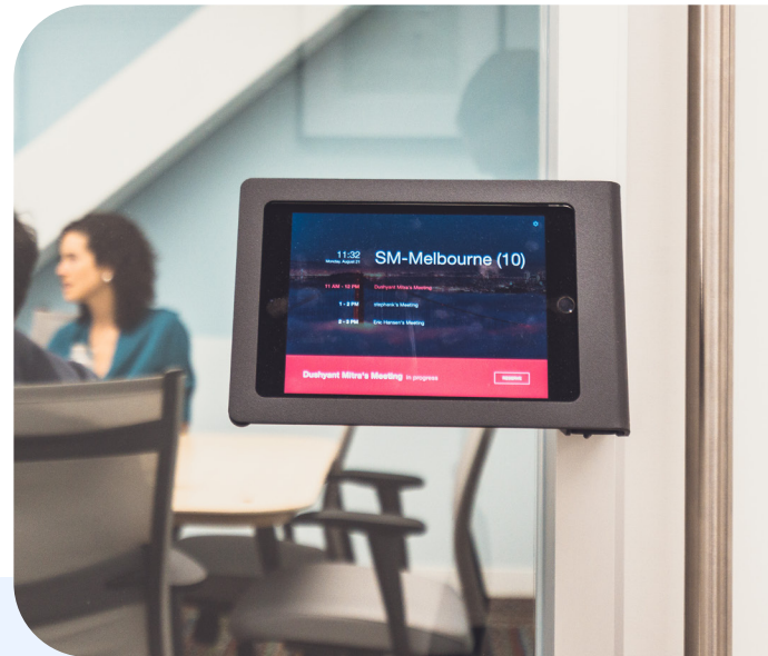
Scheduling Display provides room status and booking capabilities

End scheduling headaches with a beautiful display that provides room availability, check-in for utilization management, and capabilities to book a meeting for any available time of that day.